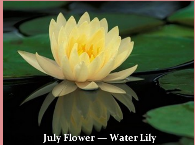
July Flower — Water Lily